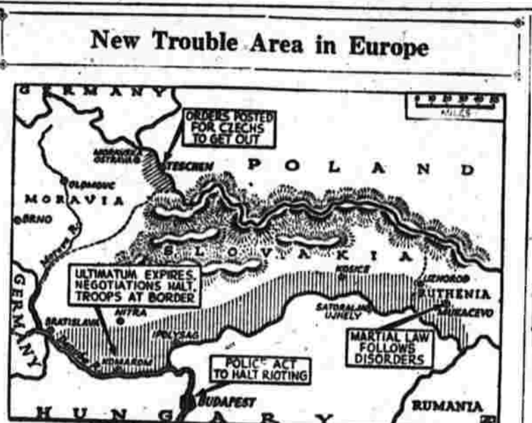
New Trouble Area in Europe